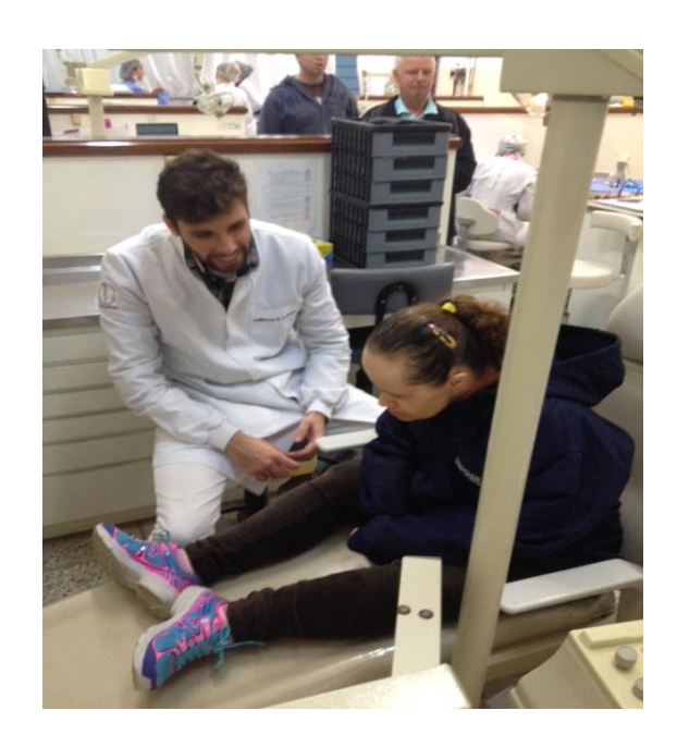
Fig. 4 The patient is reluctant to accept dental care in one of the first consultations

degrades or controls their actions, behaviors, beliefs, and decisions by means of threats, constraints, manipulation, isolation, constant surveillance, persistent persecution, insults, blackmailing, ridiculing, exploring, and limitation of their right to move around freely or by any other means which may harm their psychological health and self-determination.