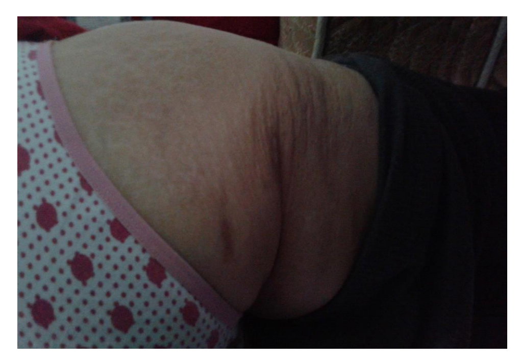
Fig. 2 – Mark on the back of her leg caused by the aggressor's kicks