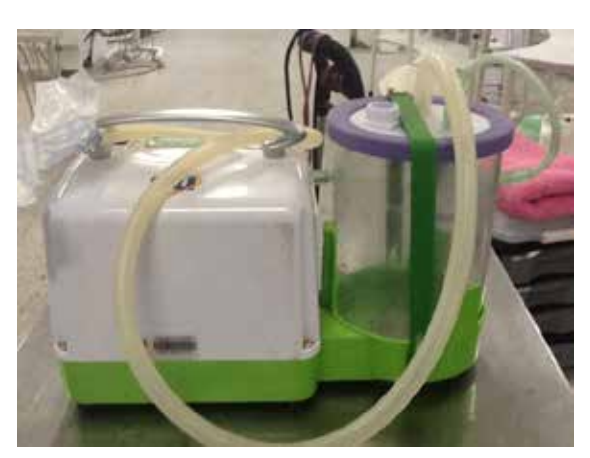
Fig. 1. Suction device

When asked about the child's oral habits, her parents explained that she used a pacifier when going to bed, and that no oral hygiene procedures had been followed yet. The patient showed a heavy flow of salivary secretion. Therefore, in the dental appointment it was necessary to use a saliva ejector to suction excess secretion through a catheter attached to a suction device brought in by her parents (Figures 1 and 2).