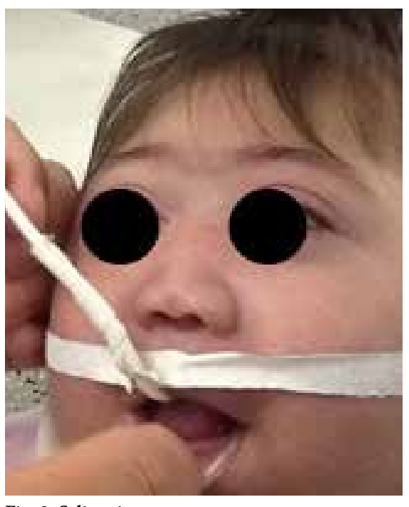
Fig. 2. Saliva ejector

The extraoral clinical exam showed microcephaly and nasal deformity. In the initial intraoral exam, Epstein pearls were detected on the lower-edge mucosa and no teeth were detected.