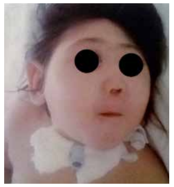
Fig. 3. Facial features

The extraoral clinical exam showed microcephaly and nasal deformity. In the initial intraoral exam, Epstein pearls were detected on the lower-edge mucosa and no teeth were detected.