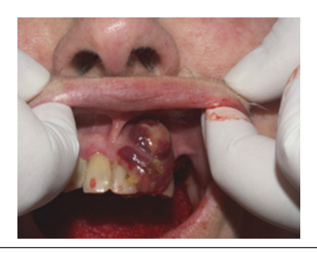
Figure 1: Front intraoral view of maxillary left-side gingival tumor

four years before. She had a cardiac arrhythmia and had had a pacemaker for four years. She had atrophy of the left heart valve and was awaiting valve surgery. She had had a total right nephrectomy two years before as the only treatment. She did not bring a histopathology report to the consultation and stated that she did not know the nature of the renal lesion that gave rise to such treatment. The patient did not report tobacco, alcohol, or drug use.