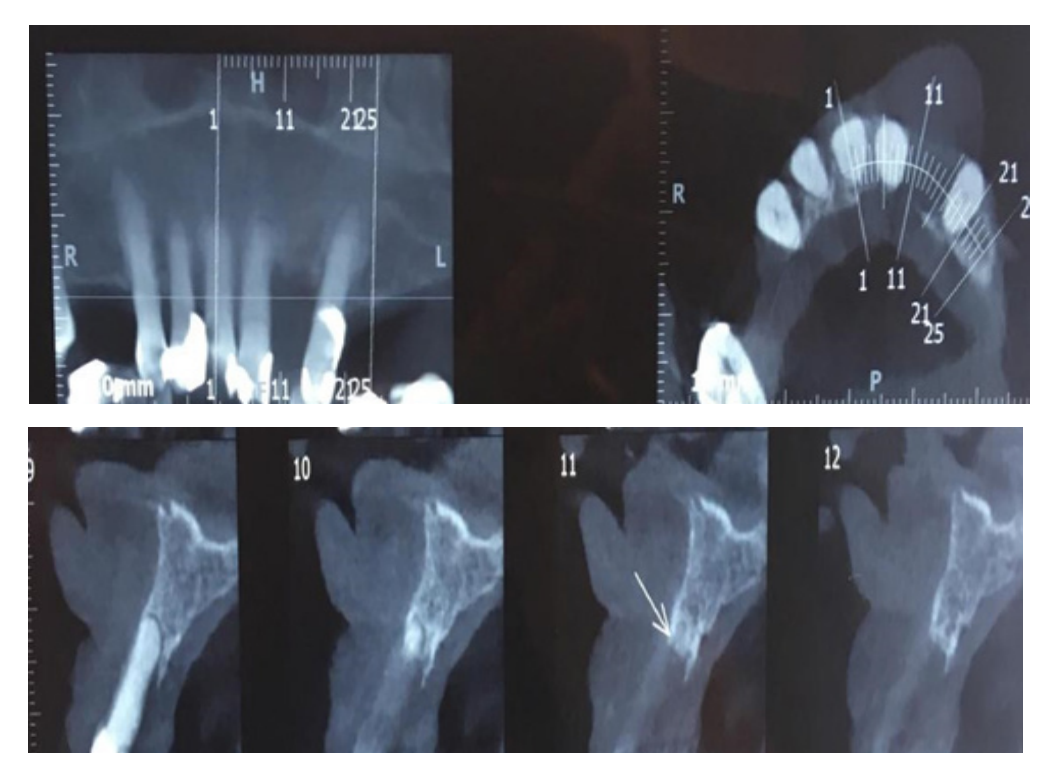
Figure 3: Microtomography. Tooth 2.2 was missing. No bone alteration.

Renal metastasis was considered a differential diagnosis due to the patient's medical history.