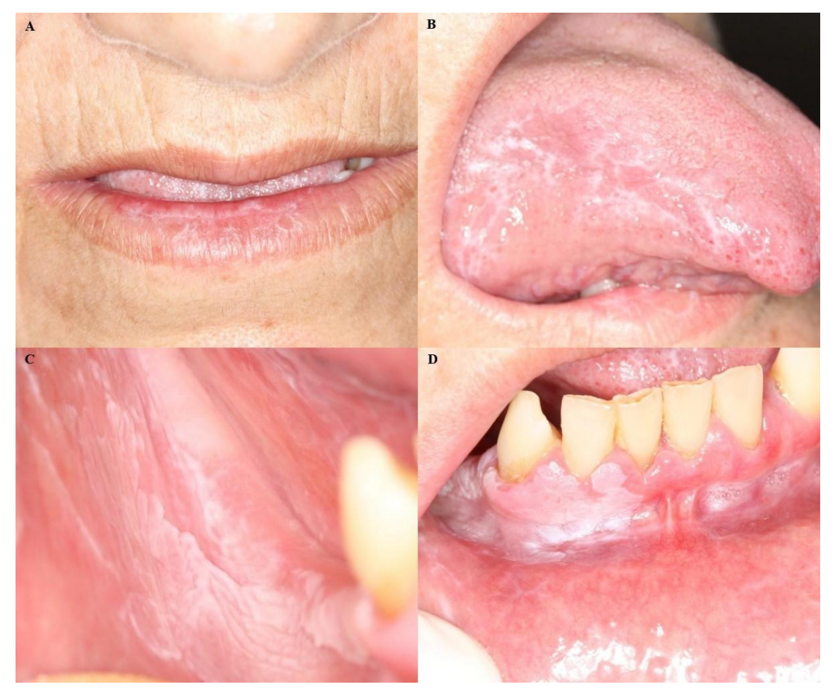
Figure 3. Photos of clinical manifestations before the second biopsy revealing white striae. A. Lower lip. B. Tongue border. Non-homogeneous and verrucous appearance of white plaque C. Buccal mucosa. D. Lower right alveolar ridge.

Immunohistochemistry reactions were performed for CD20 and CD138 proteins (Table 1). CD20 and CD138 were diffusely labeled on the inflammatory cells of the connective tissue of all biopsies performed. Epithelial intercellular junctions were positive for CD138 (Figures 2. B, C, E, F, H, and I).