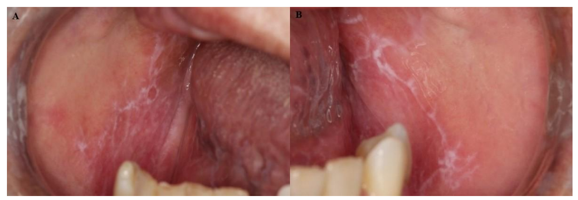
Figure 1. Photos of initial clinical manifestations, white striae on the buccal mucosa. A. Right buccal mucosa. B. Left buccal mucosa.

To rule out the clinical hypothesis of LR to Losartan®, the physician was asked to replace the antihypertensive drug, which did not improve the clinical condition, and the diagnosis of OLP was established. However, due to the COVID-19 pandemic, the patient returned for a follow-up visit three years after the initial diagnosis of OLP. White striae were noticed on the lower lip and tongue edge, multiple white plaques with a leathery surface that had a 5 mm diameter maximum located on the buccal floor, attached gingiva, and alveolar ridge of the mandible on the left and right sides that extended to the buccal mucosa, non-homogeneous and with areas of verrucous appearance (Figures 3A-D).