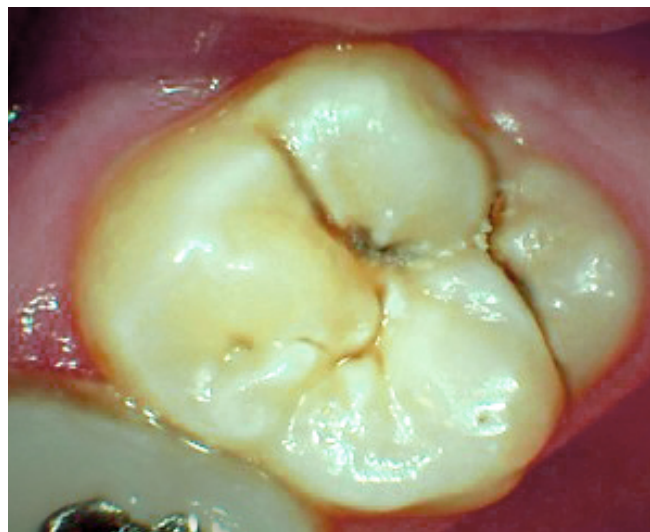
Figure 3. ICDAS 3 active.

Localized enamel breakdown, microcavitation, microbial plaque accumulation.